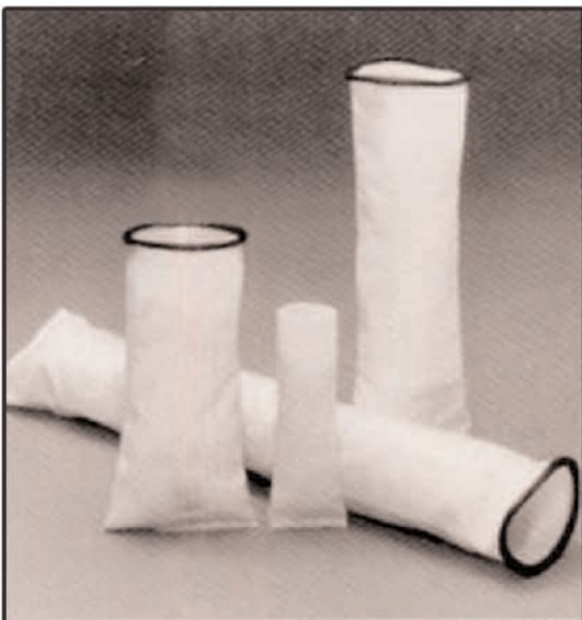
High-strength reusable bag filters